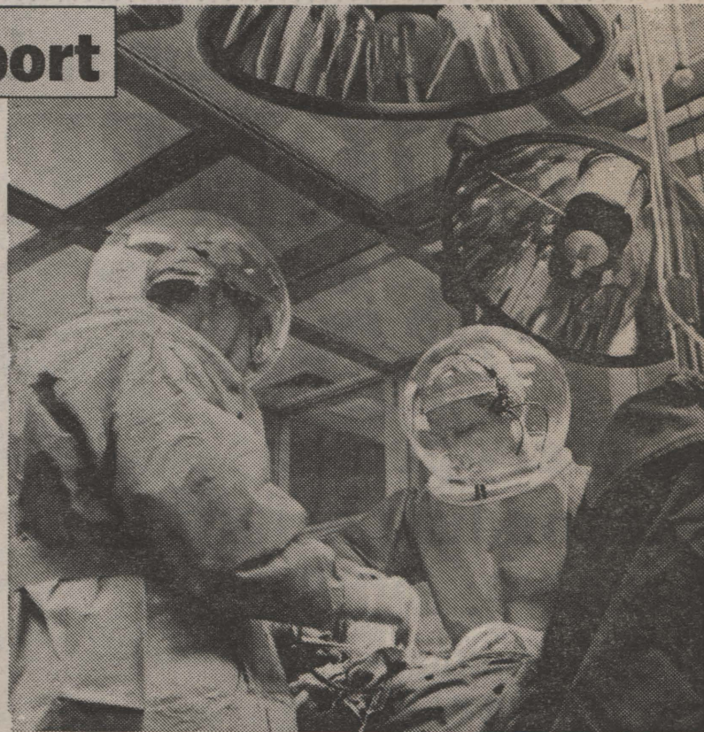
A TOP MEDICAL TEAM like this one helped save the lives of three extraterrestrials. The surgeons wore protective helmets to guard against alien viruses. Below, the Kremlin in Moscow, where experts believe the rescue efforts for the aliens were probably coordinated.

port are vague but the overall message is clear," he continued. "These extraterrestrials owe their lives to the Russians and intend to repay them in a very substantive way.